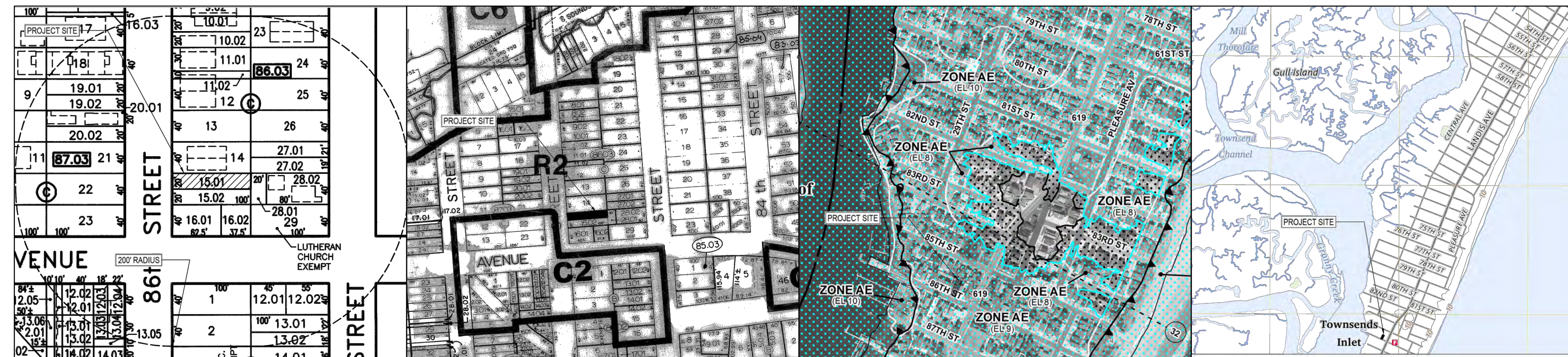
TAX MAP Map Date: 02-1973 Scale: 1" = 100' ZONING MAP Map Date: 06-27-1991 Scale: 1" = 200' FLOOD MAP Map No. 3409C0164F Map Date: 10-05-2017 Scale: 1" = 500' U.S.G.S MAP Map Date: 2021 Scale: 1" = 2000'